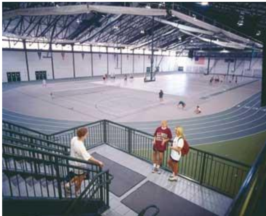
View of the Indoor Track from Second level of Shirk Center

A detailed schedule will be printed after all entries have been submitted